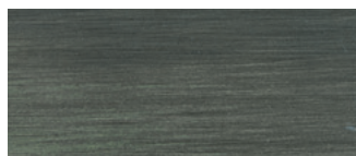
metallo brunito spazzolato a mano hand-finished burnished metal