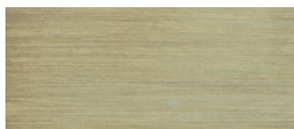
ottone satinato satin-finished brass