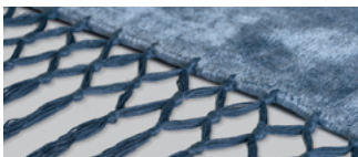
azzurro + blu azure + blue