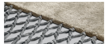
perla + grigio pearl + grey